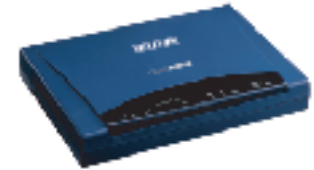
▲ BiPAC 6404VP