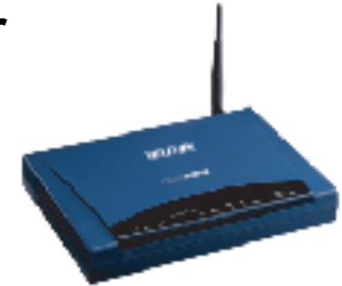
▲ BiPAC 6404VGP