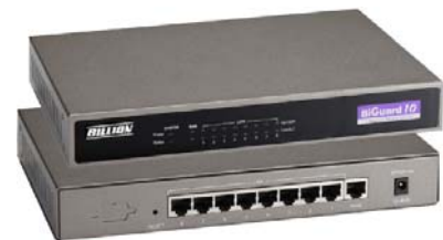
▲ BiGuard 10