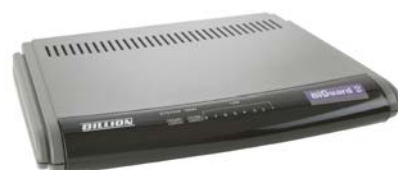
▲ BiGuard 2